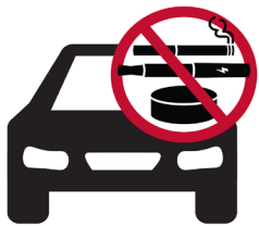
This is a Smoke-Free and Vape-Free Vehicle

Everyone shares the same air. Why not share the Smoke-Free and Vape-Free cause with others! Keep your home and vehicle safe by letting others know that your home and vehicle are Smoke-Free and Vape-Free. Request your FREE window decal at SmokeFreeSignals@gmail.com