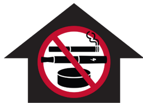
This is a Smoke-Free and Vape-Free Home