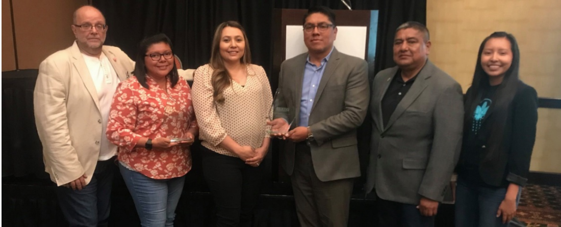
Pueblo of Acoma Behavioral Health Services & Office of Taxation and Assessments - Outstanding Community Champions Award, Secondhand Smoke Protections, 2019 (New Mexico Allied Council on Tobacco Conference)

The Community Health Leadership Program (CHLP) is seeking interested health professionals, community members, and students to apply for this exciting opportunity! With guidance from the Smoke Free Signals Project mentors, Community Health Leaders (CHL) will be able to design and implement a policy action plan tailored to their community/ organization, with the ultimate goal of creating healthy spaces free from secondhand smoke and secondhand aerosol.