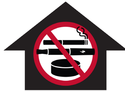
This is a Smoke-Free and Vape-Free Home