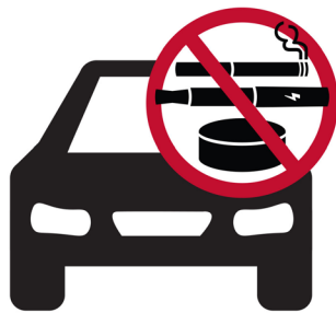
This is a Smoke-Free and Vape-Free Vehicle

Everyone shares the same air. Why not share the Smoke-Free and Vape-Free cause with others! Keep your home and vehicle safe by letting others know that your home and vehicle are Smoke-Free and Vape-Free. Request your FREE window decal at SmokeFreeSignals@gmail.com