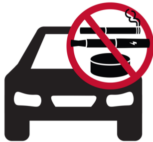
This is a Smoke-Free and Vape-Free Vehicle

Everyone shares the same air. Why not share the Smoke-Free and Vape-Free cause with others! Keep your home and vehicle safe by letting others know that your home and vehicle are Smoke-Free and Vape-Free. Request your FREE window decal at SmokeFreeSignals@gmail.com